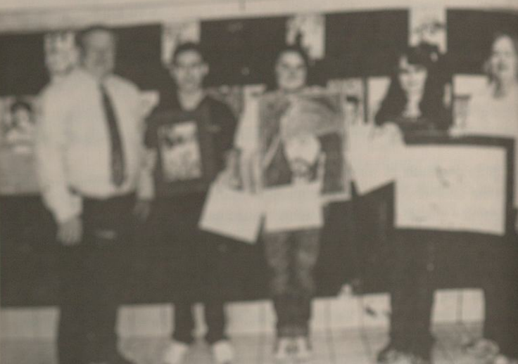
TCHS Student Council Members

The TCHS Student Council members were elected on Thursday night. The TCHS Student Council members were elected on Thursday night. The TCHS Student Council members were elected on Thursday night.