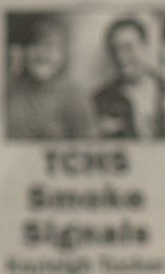
TCHS Student Council Members

The TCHS Student Council members were elected on Thursday night. The TCHS Student Council members were elected on Thursday night. The TCHS Student Council members were elected on Thursday night.