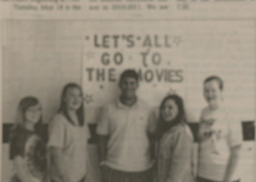
TCHS Student Council Members

The TCHS Student Council members were elected on Thursday night. The TCHS Student Council members were elected on Thursday night. The TCHS Student Council members were elected on Thursday night.