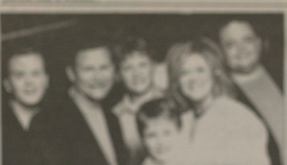
TCHS Student Council Members

The TCHS Student Council members were elected on Thursday night. The TCHS Student Council members were elected on Thursday night. The TCHS Student Council members were elected on Thursday night.