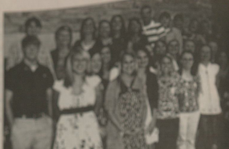
TCHS Student Council Members

The TCHS Student Council members were elected on Thursday night. The TCHS Student Council members were elected on Thursday night. The TCHS Student Council members were elected on Thursday night.